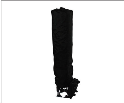
1. Remove from bag