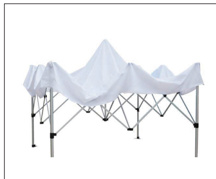
7. Lift inside pole in center to extend frame completely