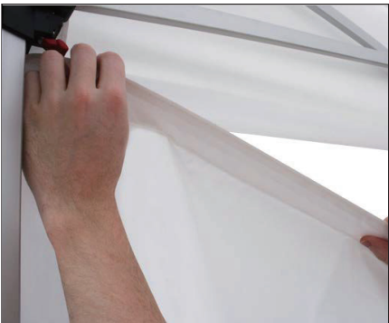
13. Apply fullwall to top Velcro strip inside canopy