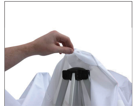
6. Make sure canopy is flush on hardware