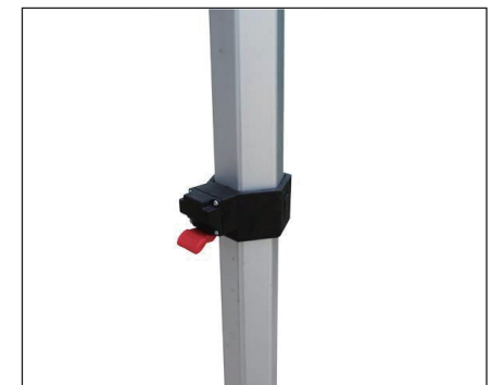
9. Lift the 2 adjacent outer legs and slide out the inner legs until the snap button locks into the hole in the outer leg