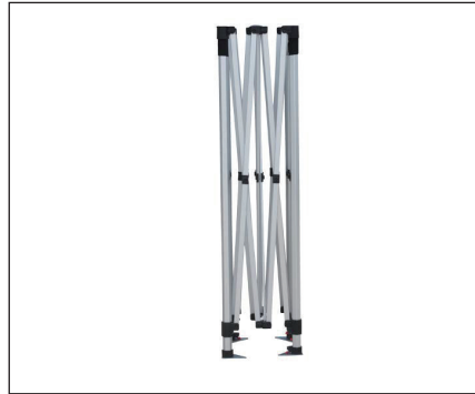
2. Place feet on stable ground