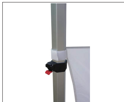
16. Attach each side of pole to pole collar; Secure with Velcro strip (x3)