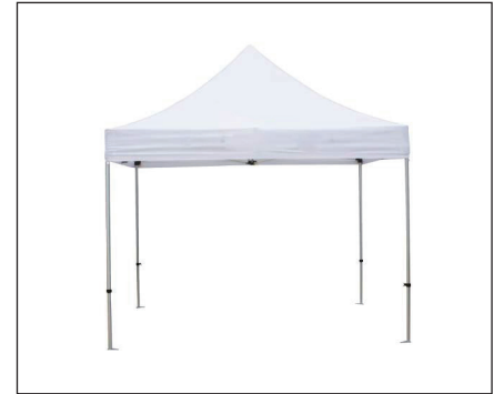
12. Canopy kit assembled