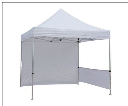
17. Halfwall assembled