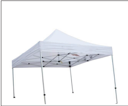
10. Repeat on opposite legs; Make sure to do two legs at a time. *Minimum of two people recommended.