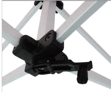
11. Spin winder in the center of the frame to completely tighten tent