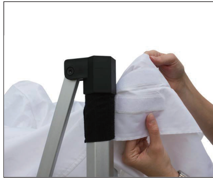
5. Align the canopy top over the frame corners and place Velcro on all 4 corners (none on top piece)