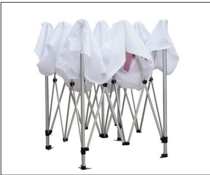
4. Lay canopy over top of frame