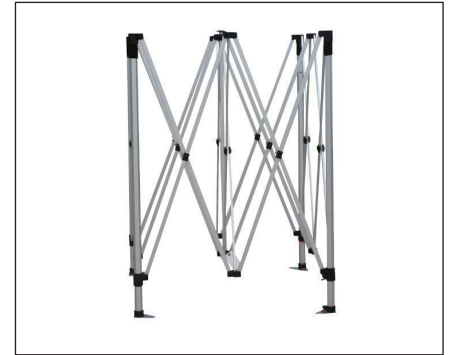
3. Extend frame to extended size of 1.2m x 1.2m