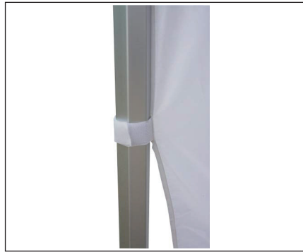
14. Secure to side poles with Velcro strips (x4 per pole)